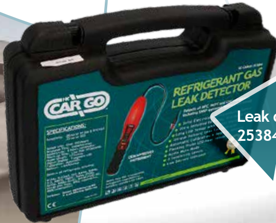
Leak detector 253844