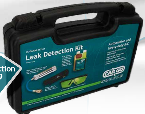
Leak detection kit 253519