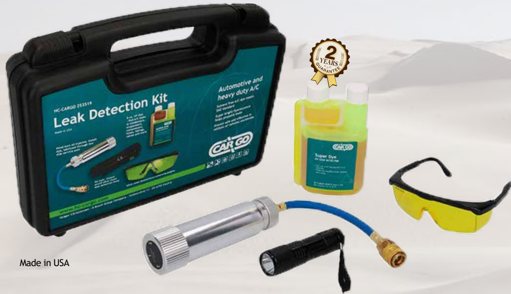
Made in USA