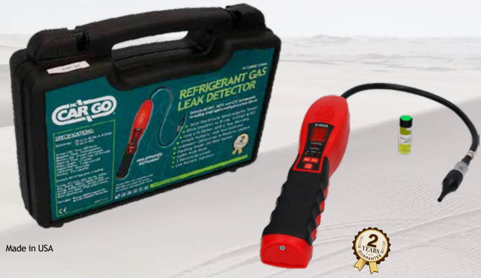
Made in USA